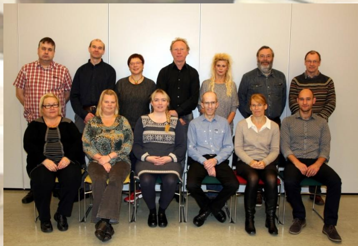
Partner meeting 1 in Akureyri