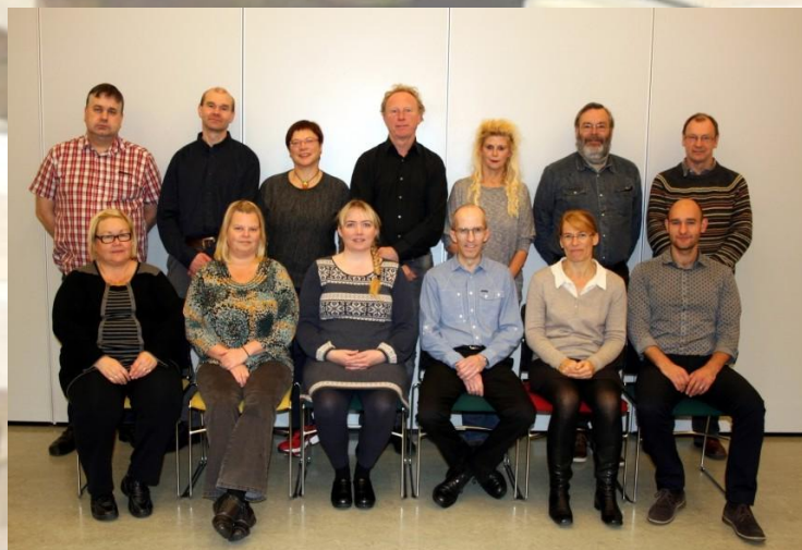
Partner meeting 1 in Akureyri