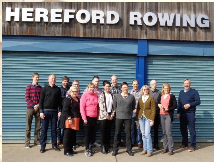
Partner Meeting 2 in Hereford